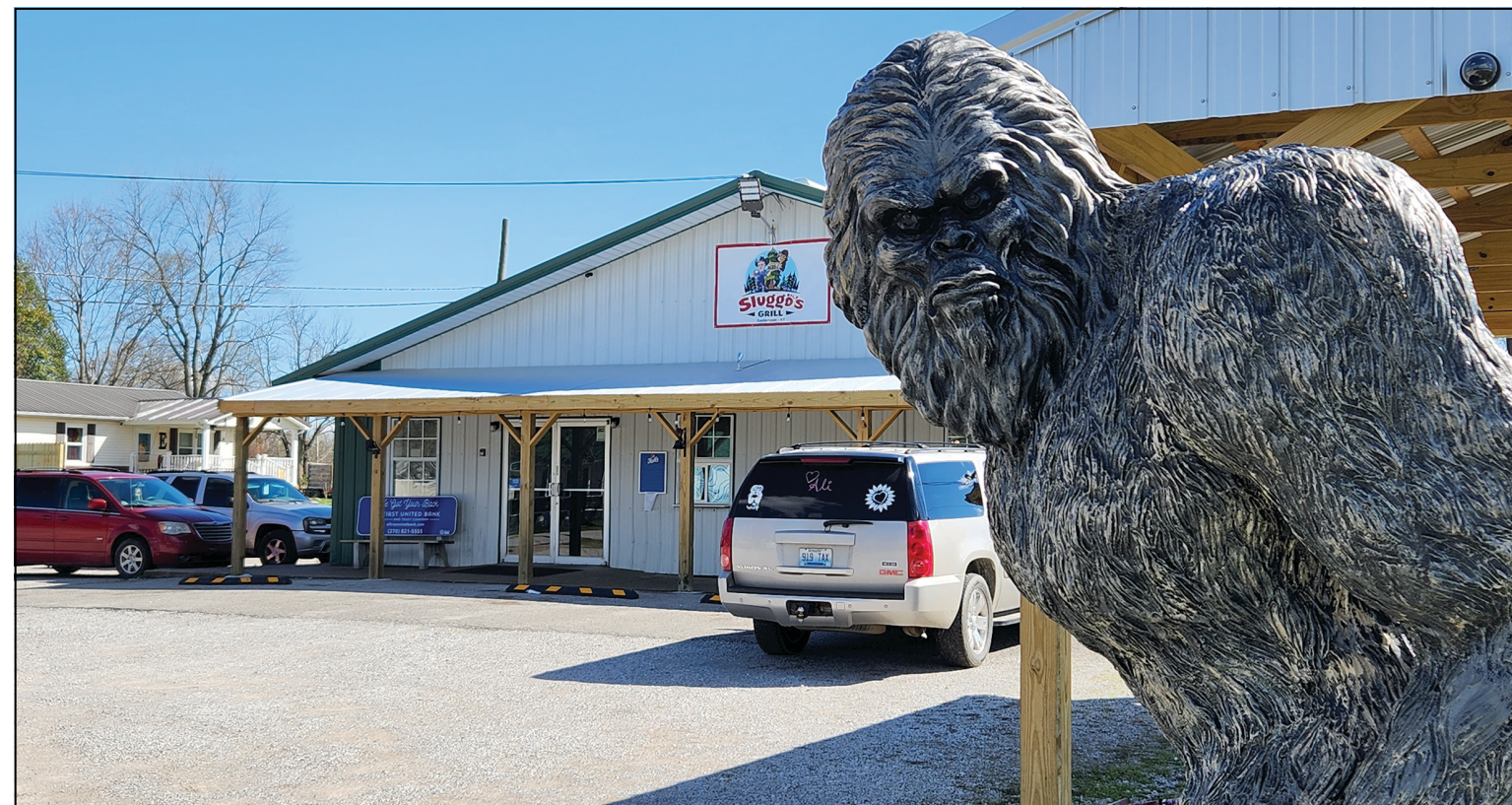
A life-sized Bigfoot statue keeps an eye on the roadway in front of Sluggo's Grill in Centertown, Ky. So when you are in the area looking for sasquatch you can stop by for one of Sluggo's signature Bigfoot burgers.

By Lee Bratcher Mainly Local Business Spotlight