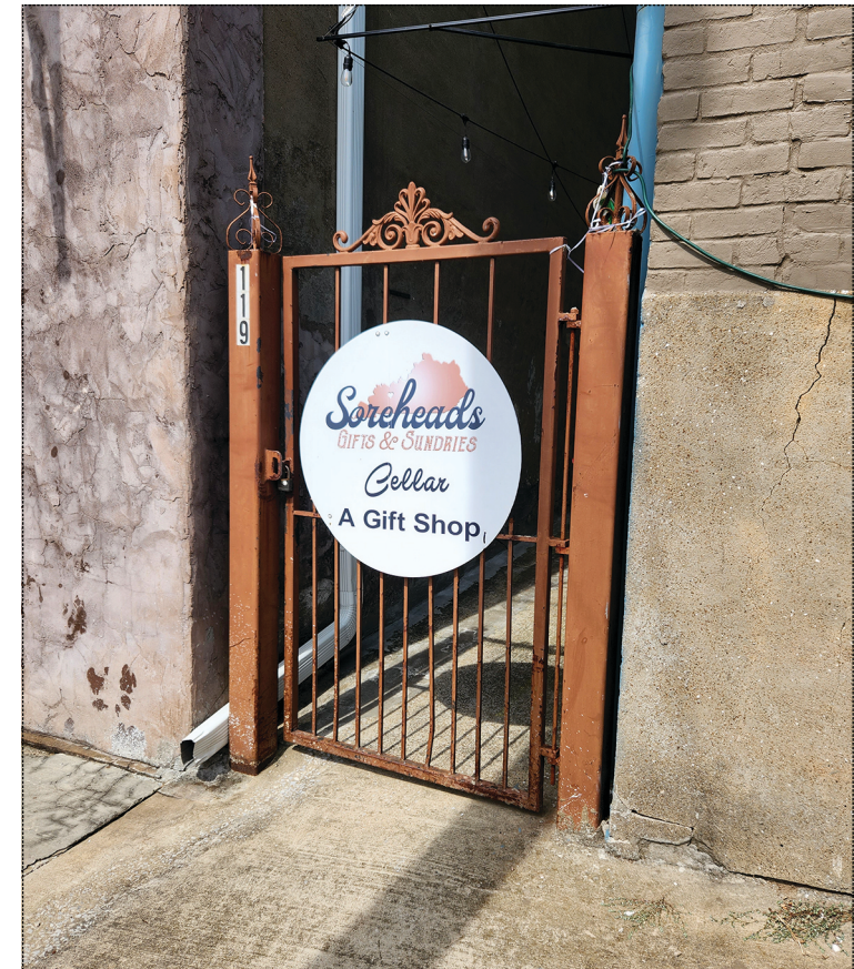
The Christmas Cellar is located behind Soreheads Gifts behind the store in the alley behind the gate.