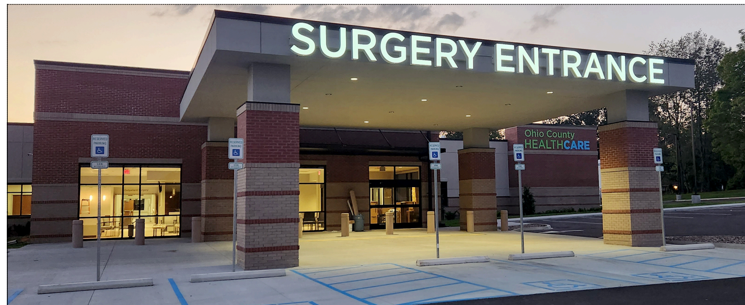
The entrance to the newly constructed surgical wing at Ohio County Healthcare.

The surgical wing was designed by ESA Continued on Next Page