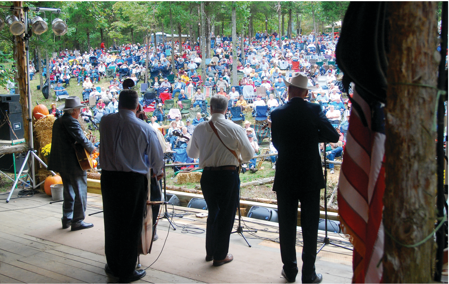
Much like many festivals, the Jerusalem Ridge Festival is building its way back following the COVID pandemic but past festivals were attended by thousands of bluegrass fans.