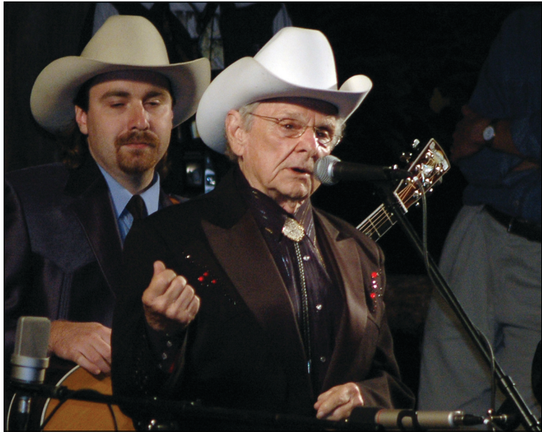
The late Dr. Ralph Stanley talks to the crowd at the 2005 Jerusalem Ridge Festival. Stanley played the festival multiple times before his death in 2016.